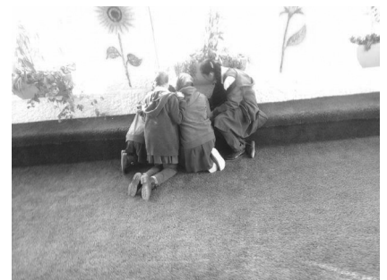
Working together as a team to try to solve the clue